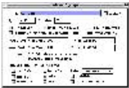
"Agrippa" disk info