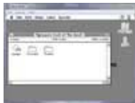
Folder on Mini vMac emulator with System 7 used to run the poem

Rapid access: Google Video Higher-quality: QuickTime video