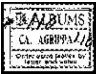
Agrippa label (picture included on disk)