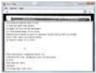
"The mechanism..." (the poem continues)