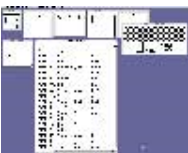
Exploration of resource fork of "Agrippa" disk with ResEdit program

Sounds included on "Agrippa" disk: camera click and gunshot