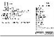
Hidden "Desktop" info file