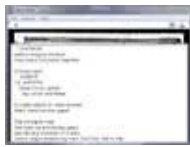
"I hesitated..." (Beginning of poem as it scrolls up screen)