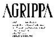
Agrippa credits screen (picture included on disk)

Sounds included on "Agrippa" disk: camera click and gunshot