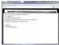
"laughing, in the mechanism" (the poem ends)