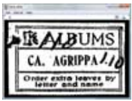
Agrippa "label" at start of poem's run