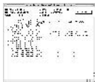
Sector 2 (interpreted)