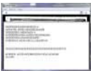
Encrypted text appearing after end of poem