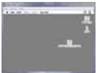
Desktop of Mini vMac emulator with System 7 used to run the poem